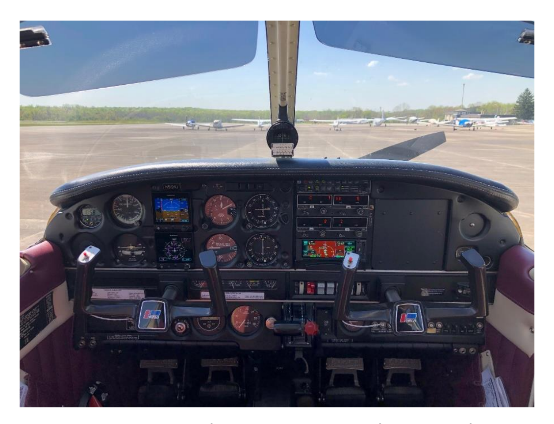
Piper Warrior N8194J Above. Piper Twin Comanche N8065Y Below.